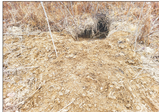
A black bear den in the Necedah National Wildlife Refuge.

110 W. Lake St. Horicon, WI 53032 (920) 485-4241 www.rockrivertap.com A Great Place to Eat Lunch & Dinner!