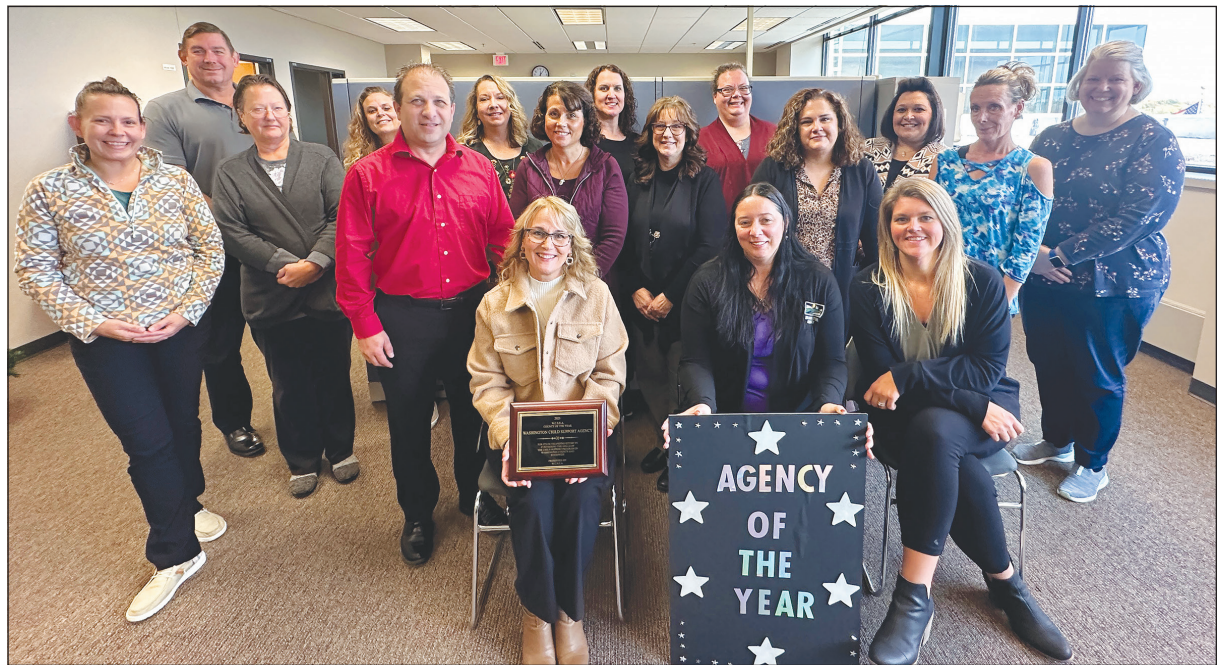
The Washington County Child Support Agency is recently named the Agency of the Year by the Wisconsin Child Support Enforcement Association.

The Wisconsin Child Support Enforcement Association (WCSEA) named the Washington County Child Support Agency the Agency of the Year for the first time in the history of the Child Support Agency. WCSEA is the statewide association that works to foster the exchange of ideas and suggest methods for improvement of the state's child support program. The award was presented at the WCSEA's recent statewide fall conference.