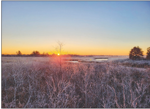
A beautiful sunrise in the Necedah National Wildlife Refuge.

Seventeen of us slept at camp last night. As you can imagine, there are a lot of individual stories.