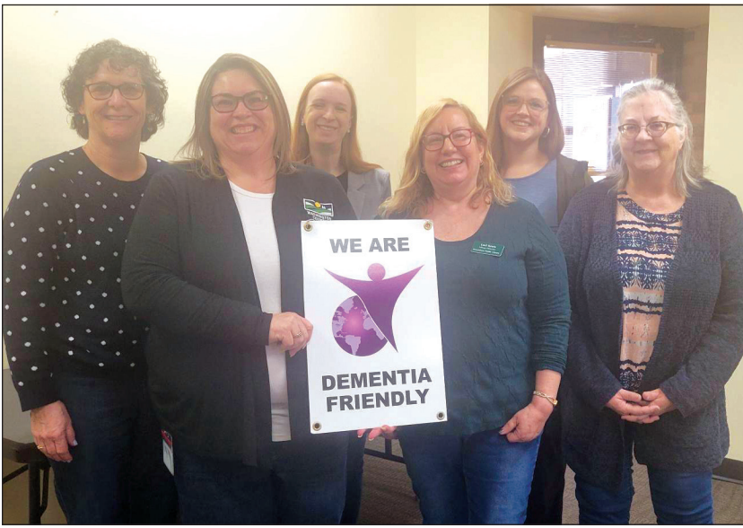
Kewaskum Public Library is now "dementia friendly" after staff training with the ADRC of Washington County.