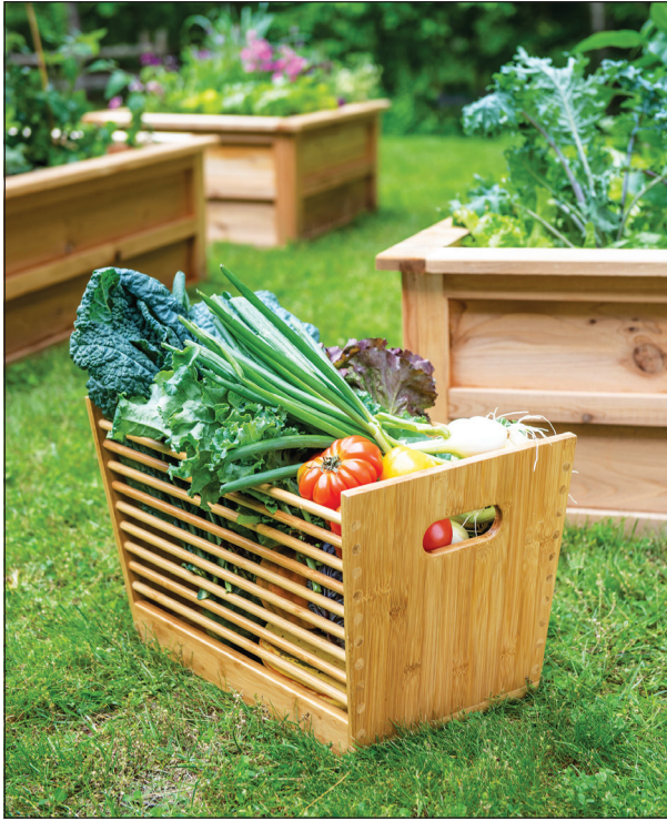
This all-in-one basket, stool and seat, the Bamboo Garden Stool and Basket Combo, allows gardeners to carry tools, plants, and veggies or turn it over to sit on for weeding or planting.

For people who like to garden outdoors, containers, stakes, trellises, and tools are always welcome