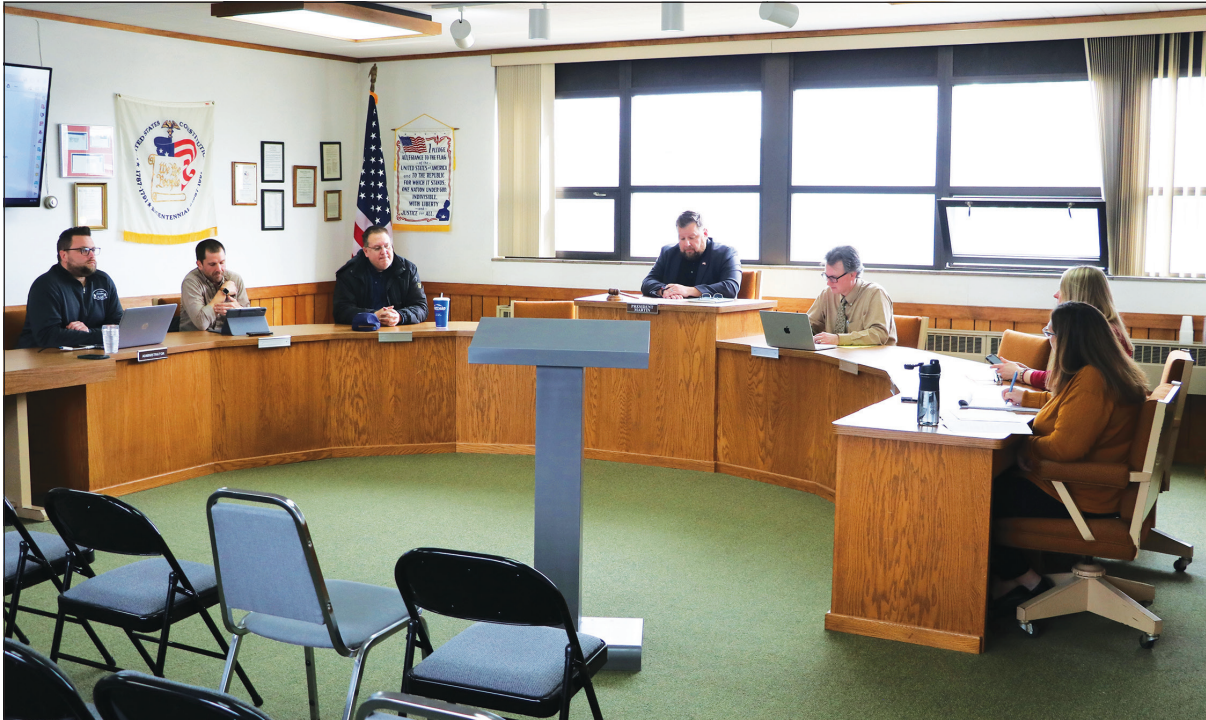
A meeting of the Village of Kewaskum Joint Review Board from Monday, April 24. Following the meeting, a new tax incremental district - TID 4 - was created by the board voting in approval.