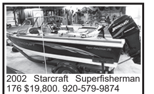
2002 Starcraft Superfisherman 176 $19,800. 920-579-9874

1999 17ft Syvian 90 Merc. $6000. 920-214-3215.