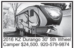
2016 KZ Durango 30' 5th Wheel Camper $24,500. 920-579-9874