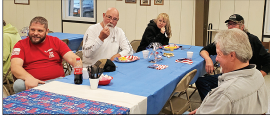
The people of Osceola showed their appreciation for veterans by offering a free breakfast for every veteran and their family in the Osceola Town Hall on Nov. 11.