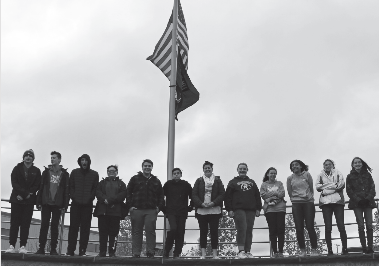
Students from Holy Trinity School in Kewaskum visit the Wisconsin 9/11 Memorial on Veterans Day.