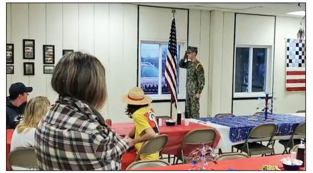
A flag ceremony is held in the Osceola Town Hall on Veterans Day, Nov. 11, followed by a free breakfast for veterans and their families.