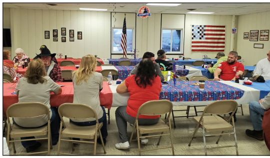
A free breakfast was available for every veteran and their family at the Osceola Town Hall on Veterans Day, Nov. 11.

Rob and Danelle plan to hold the breakfast again next year, God willing, and hope more veterans will venture to the Osceola Town Hall for breakfast and an heartfelt appreciation for their service to our nation.