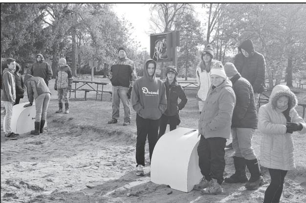
Students in grades five through eight from Holy Trinity School in Kewaskum learn about area glacial formations during their "Ice Age at the Beach" field trip at Mauthe Lake. Through glacial reenactment using sand, students discovered how the beautiful Kettle Moraine landscape near Kewaskum was formed.