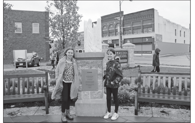
Students from St. Lucas School in Kewaskum visit the Wisconsin 9/11 Memorial on Veterans Day.