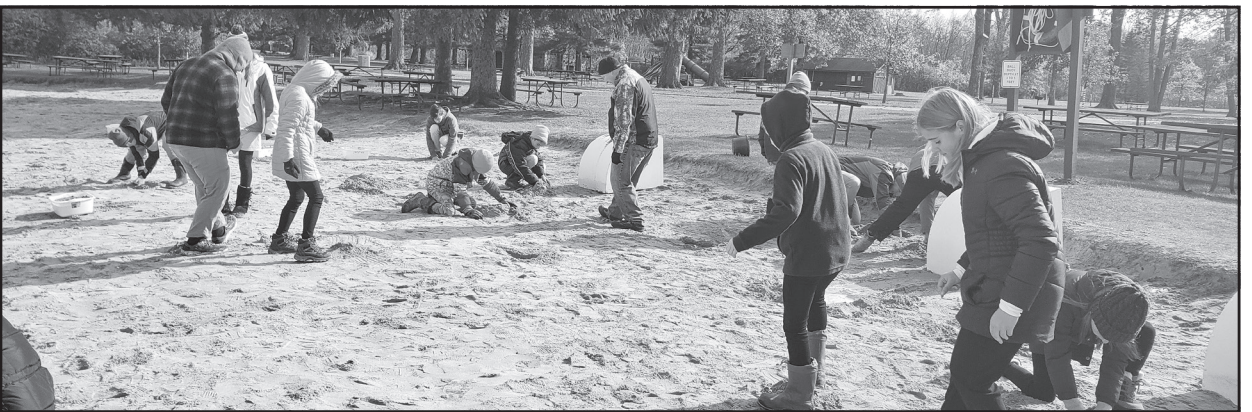
Students in grades five through eight from Holy Trinity School in Kewaskum learn about area glacial formations during their "Ice Age at the Beach" field trip at Mauthe Lake. Such formations include Hershey-kiss shaped kames, tear-shaped drumlins near Campbellsport, snake-like esker hulls, kettle lakes, dry kettles, moraines and more. PHOTO SUBMITTED