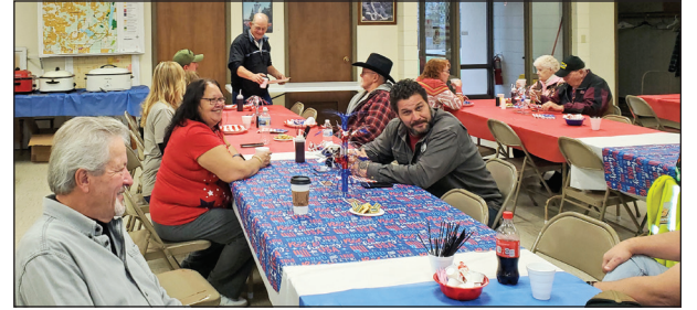
Veterans and their families enjoy a free breakfast in the Osceola Town Hall on Veterans Day, Nov. 11.