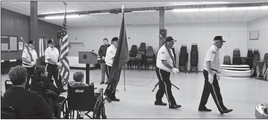
The Honor Guard from American Legion Post 384 retires the colors during a presentation held in the Kewaskum Annex building on Veterans Day. Following the presentation, attendees went outside to look at the Wisconsin 9/11 Memorial.