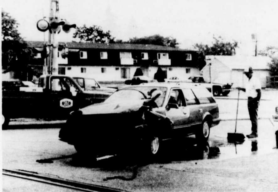
Public Works Superintendent Augie Bilgo began cleaning up debris at Monday's train/car collision.