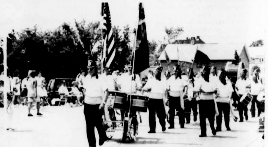
The Tripoli Drum and Bugle Corps of Milwaukee.