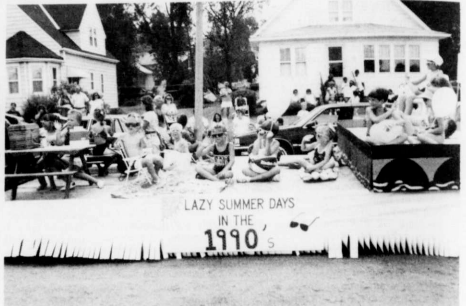
The children of My Little Friends Day Care Center rode on a flatbed filled with summer fun. They took second place.