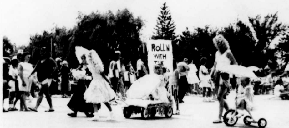
Darling children's entries brought a multitude of "aren't they cute" from the crowd.