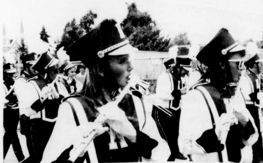
Members of our own Kewaskum High School band sporting their new uniforms.