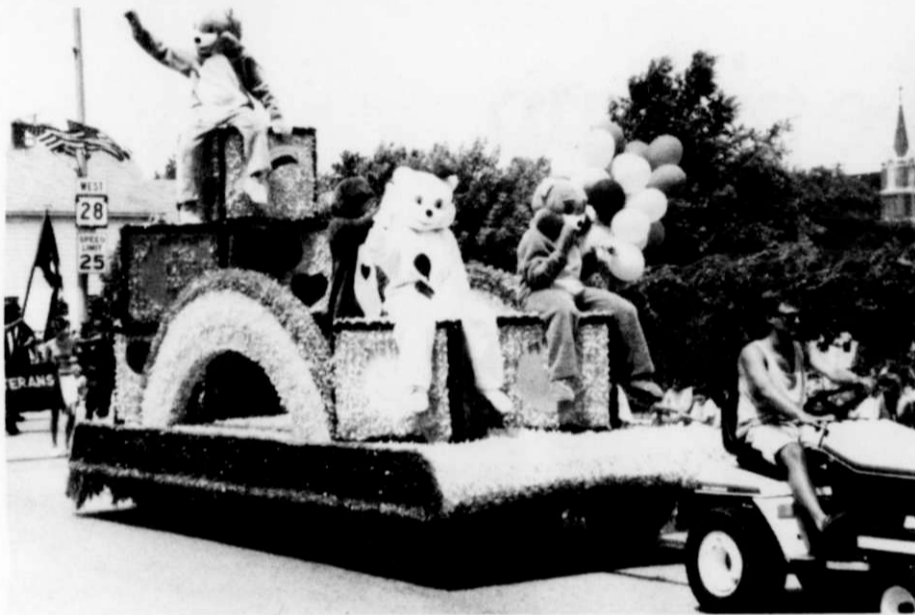
Regal Ware's beautiful entry brought smiles to the faces of young and old alike.