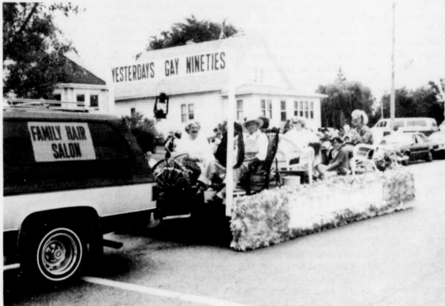
Family Hair Salon won first place parade honors with their "Gay Nineties" entry.