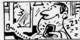
The first electric shavers went on sale in 1931.

Division II 2, 4, 6, 8. Party for all teams and parents follows the all star game.