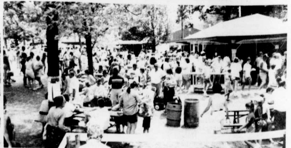
A huge crowd flocked to Riverhill park after Sunday's parade to enjoy the good food and cool refreshments in spite of the 90 degree weather. Maybe we should call the picnic Kewaskum's Humidity Days, because if its the weekend of the picnic... count on it being hot!