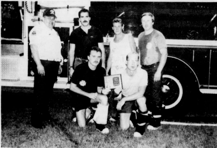
The water fighters from Hartford took second place.