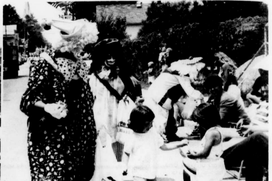
An important part of any parade, clowns handed out candy to children along the street.