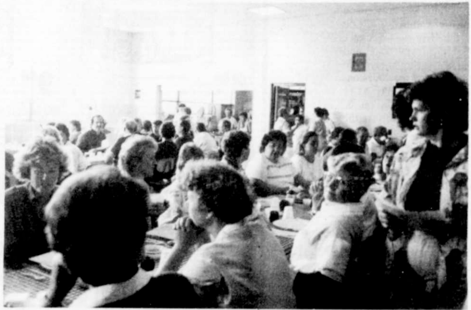
After the early morning exercise, it was back to the high school and breakfast before the day's meetings began.

At the conclusion of the breakfast meeting, the teachers continued the in-service, attending other meetings in preparation for the opening of school on Wednesday.