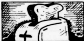
The first automatic pop-up electric toaster was marketed in June, 1926. It received one slice of toast at a time.

To register for any of these evening classes, call 334-0909.