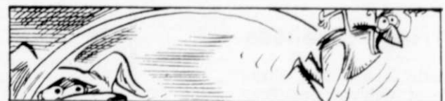
A flea can jump 200 times the length of its own body.