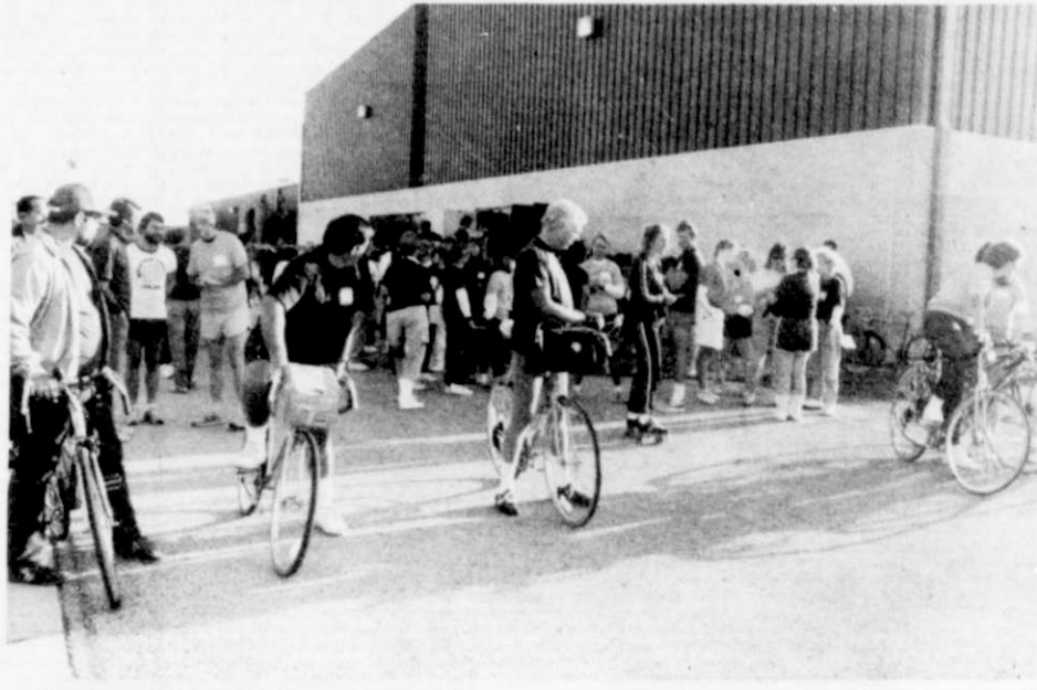
It was walk, run, bike or roller skate in the 2nd Annual KeWalkSum Classic at the beginning of the Kewaskum School District's in-service day.