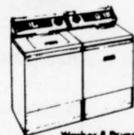
Washer & Dryer