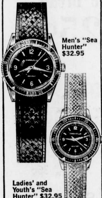
Men's "Sea Hunter" $32.95

by BULOVA Now... two rugged Sea Hunter watches for every active member of the family. Water resistant to a depth of 666 feet. Rotatable elapsed time indicator. 17 jewel precision movement. Stainless steel case. Luminous dial. Waterproof strap. Great gift for all the sports in your life.