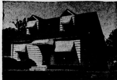
The electrically heated Norbert Zess home at 3724 E. Cudahy Ave., Cudahy

TO SUPPLY NO. 3 FUEL OIL TO THE KEWASKUM COMMUNITY SCHOOLS, JT. DISTRICT NO. 2. WRITE SUPT. OF SCHOOLS, P. O. BOX 37, KEWASKUM, WIS. 53040 FOR DETAILS. BID OPENING: 8:00 P. M. SEPTEMBER 14, 1970.