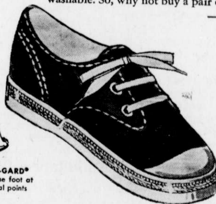
ARCH-GARD® cushions the foot at all 3 vital points

Here's a dandy shoe for the youngsters—it'll put spring in their step all summer long. The exclusive RED BALL Arch-Gard is there to support little feet. Air passes freely through the colorful upper fabric to keep feet cool — fresh. And, because little playshoes can get mighty dirty, we've made the Playland completely washable. So, why not buy a pair or two — soon.