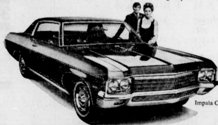
Impala Custom Coupe

Putting you first, keeps us first. CHEVROLET