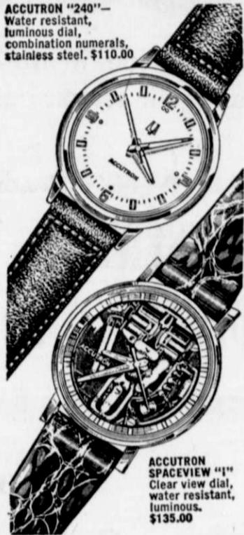
ACCUTRON "240"— Water resistant, luminous dial, combination numerals, stainless steel. $110.00