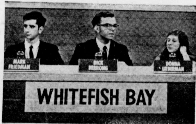
Champion, Fall 1968