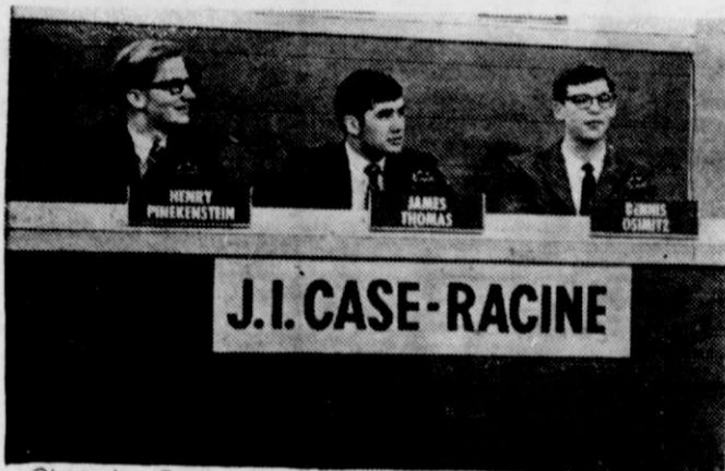
Champion, Spring 1969