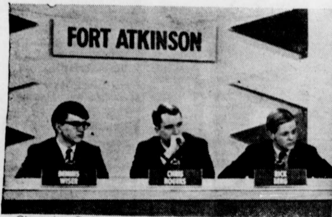
Champion, Spring 1968