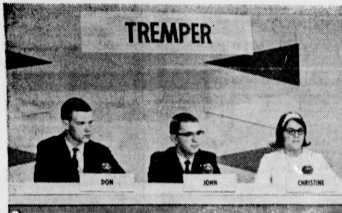
Champion, Spring 1967