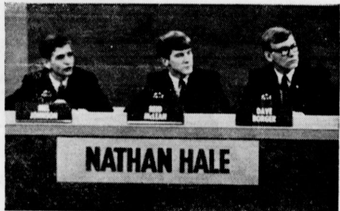
Champion, Fall 1967