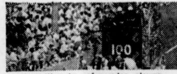
6 exciting days of parades, clowns, circus wagons, fireworks, and Circus Parade July 4th.