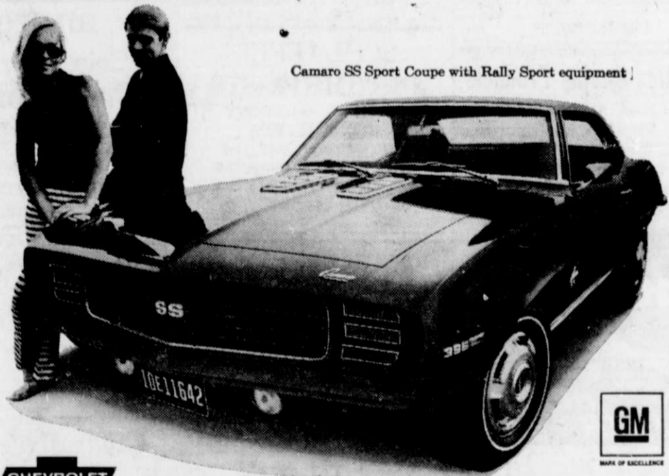
Camaro SS Sport Coupe with Rally Sport equipment