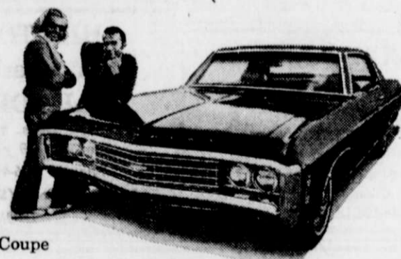
Impala Custom Coupe

$101 less than last year's Impala with comparable equipment.