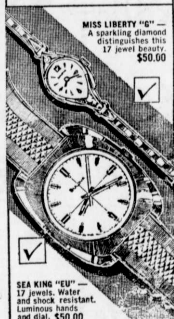
MISS LIBERTY "G" — A sparkling diamond distinguishes this 17 jewel beauty. $50.00