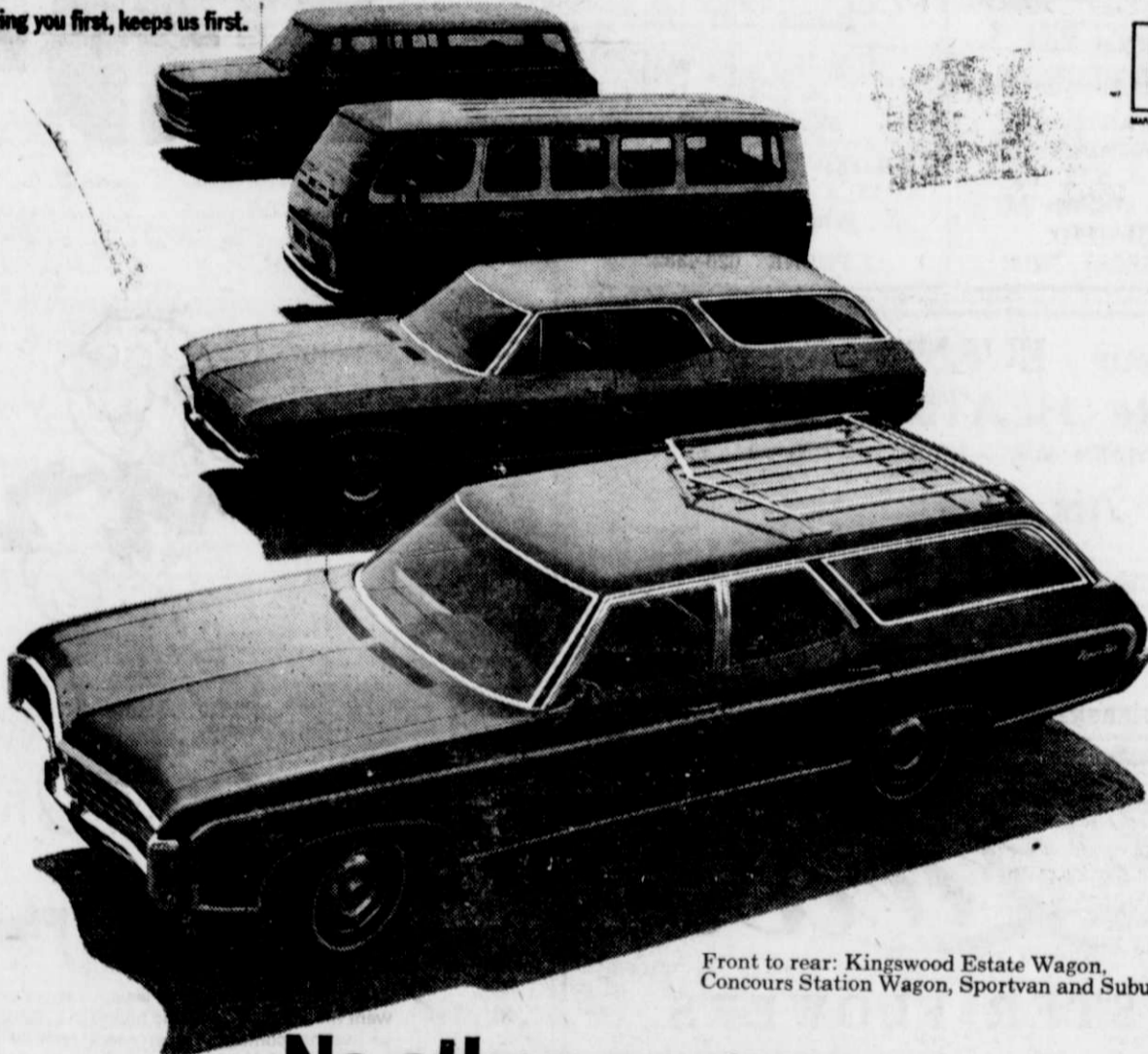
Front to rear: Kingswood Estate Wagon, Concours Station Wagon, Sportvan and Suburban.