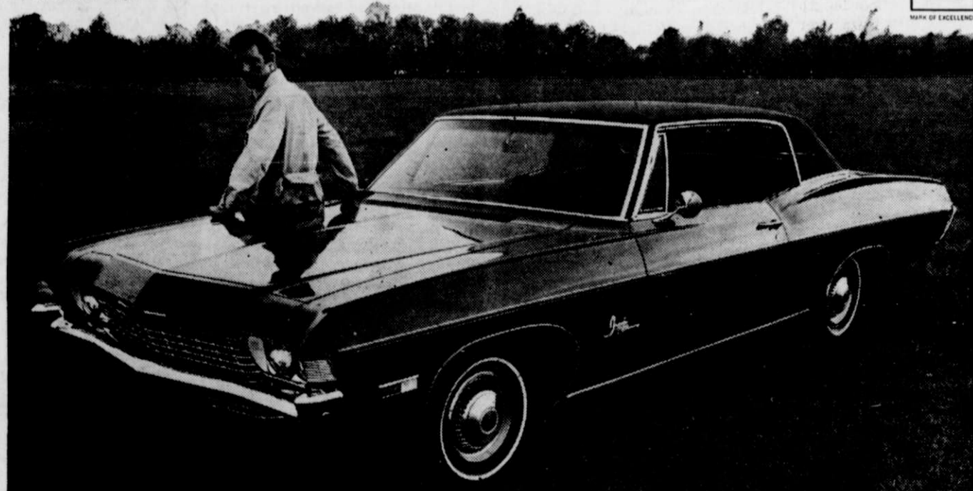
Impala Custom Coupe