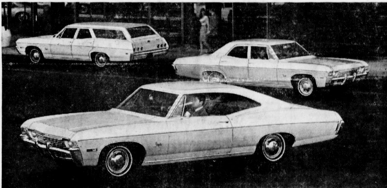
Impala Sport Coupe (foreground), 4-Door Sedan, Station Wagon