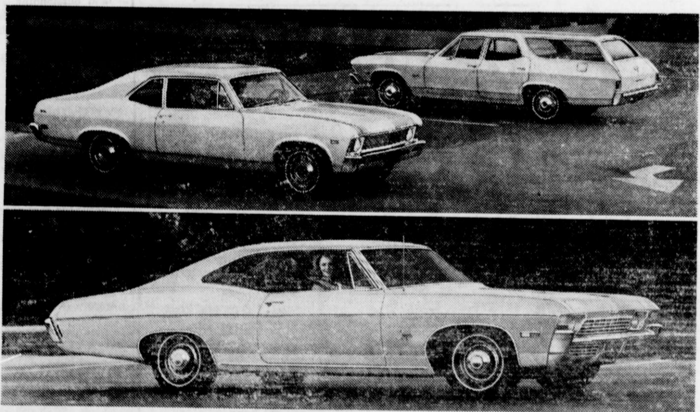
Nova Coupe and Nomad Station Wagon top, Impala Sport Coupe bottom.

Our lowest priced car—Nova Our lowest priced wagon—Nomad Chevrolet—low price is a tradition.