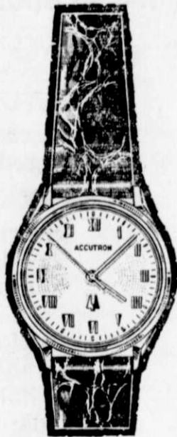
ACCUTRON "425" Waterproof,* sweep second hand, applied roman numerals. Rust alligator strap. $135.00

the most accurate wrist timepiece in the world