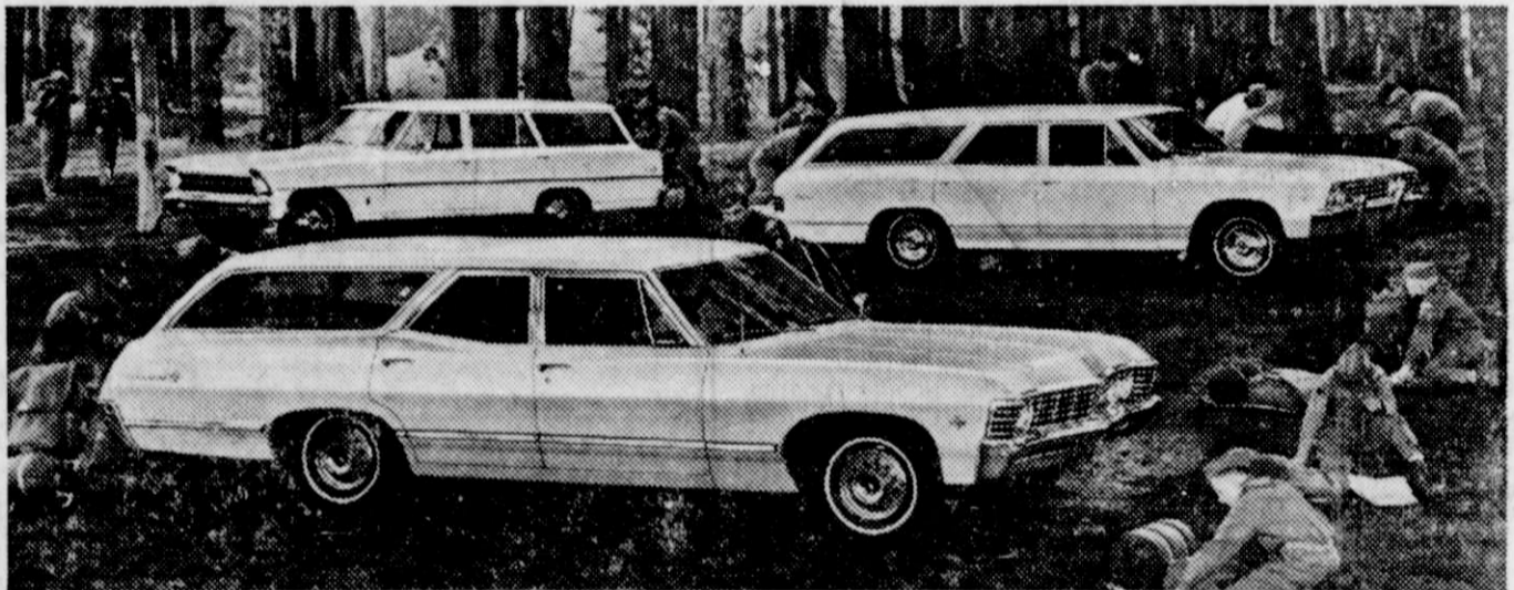
Top left: Chevy II Nova Station Wagon. Foreground: Chevrolet Impala Station Wagon. Top right: Chevelle Malibu Station Wagon.

When you look for the most room and the smoothest ride and the best value, you'll end up with a Chevrolet wagon everytime.