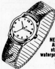
NEW RIPTIDE All weather stainless for waterproof watches $4.95