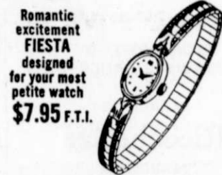
Romantic excitement FIESTA designed for your most petite watch $7.95 F.T.I.