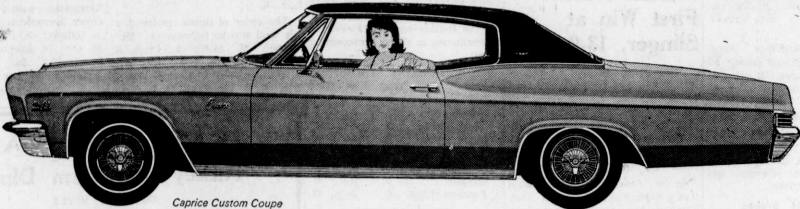
Caprice Custom Coupe