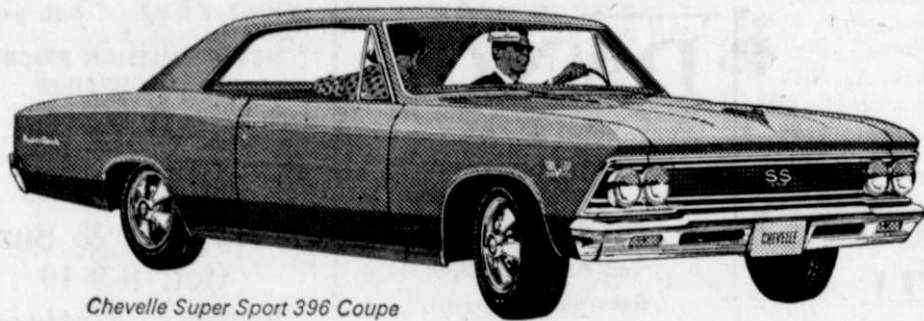
Chevle Super Sport 396 Coupe

New 300's. New 300 Deluxe models. New Malibus. And two new Super Sport 396's—coupe and convertible—with engines that tell you exactly what kind of Chevells they are. Both are available with 396-cu.-in. Turbo-Jet V8's, either 325 hp or 360 hp. And both come with special hood, grille, suspension, emblems, red stripe tires, floor-mounted shift. Twelve beautiful new Chevells in all—and all as new inside as they are outside, headlamps to taillights.