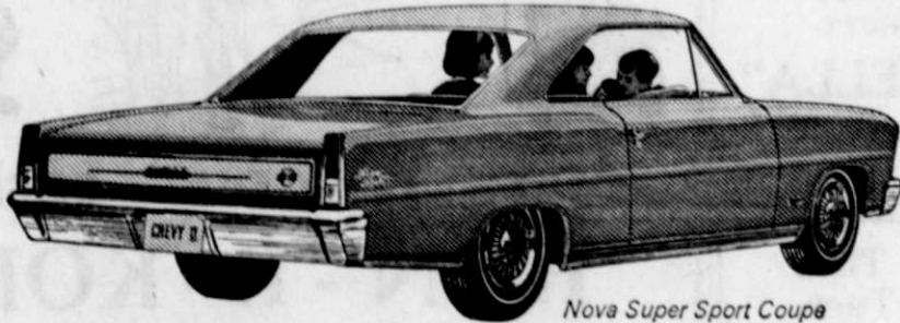
Nova Super Sport Coupe