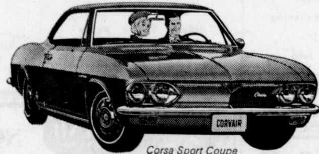
Corva Sport Coupe