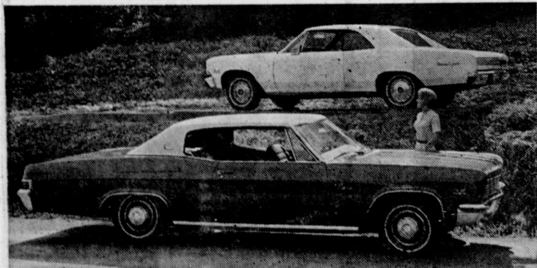
Two of Chevrolet's newest additions for 1966 are the luxurious Caprice Custom Coupe (below) and the stylish Chevelle Super Sport 396 Coupe. The Caprice Coupe is destined to be the style leader among regular size cars and the Chevelle Super Sport is distinguished by a new roof line with recessed rear window and a '396 SS' identification in grille and rear cove area. Caprice models feature distinctive wraparound rear lamps. Along with these two models, Chevrolet will offer 48 other models for 1966. Dealers will show the new cars for the first time Oct. 7.