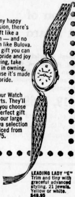
LEADING LADY "E" Trim and tiny with graceful advanced styling. 21 jewels. Yellow or white. $49.95

See our Watch Experts. They'll help you choose the perfect gift from our large Bulova selection — priced from $24.75.