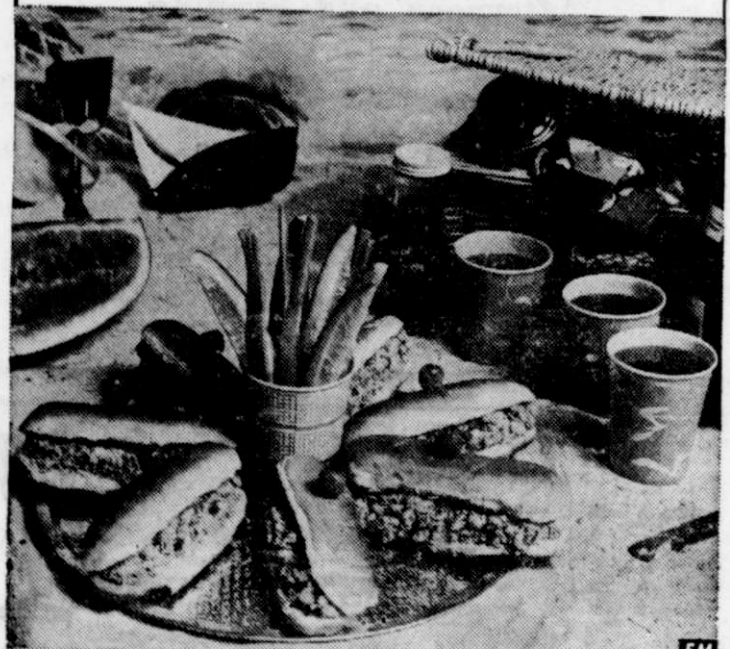
Hot Dog rolls stuffed with a savory salmon filling make delectably different fare for outdoor feasting.

Tradition makes but three requisites for a perfect picnic. They are, in order: hungry humans, good food and a pleasant spot for outdoor dining.