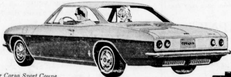
New Corvair Corsa Sport Coupe

'65 Chevy II Nova It's the liveliest, handsomest thing that ever happened to thrift. V8's available with up to 300 hp.