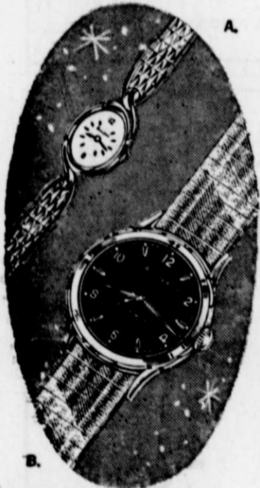
A. LEADING LADY—Trim and tiny with graceful advanced styling. 21 jewels. $49.95