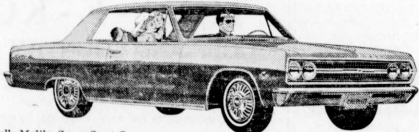
'65 Chevelle Malibu Super Sport Coupe

'65 Chevrolet Impala It's longer, lower, wider—with comforts that'll have many expensive cars feeling a bit envious.