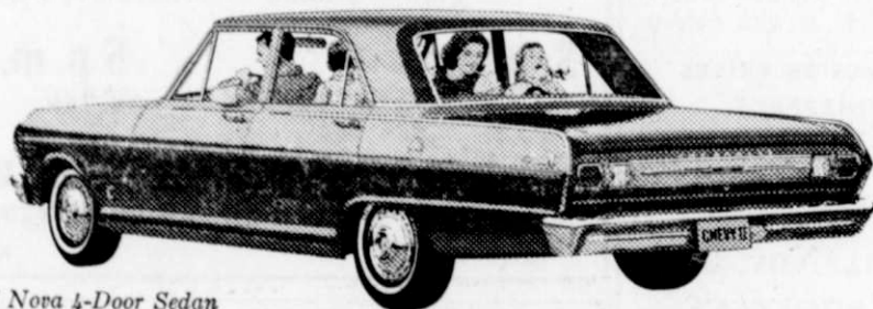
'65 Chevy II Nova 4-Door Sedan

'65 Chevelle Malibu It's smoother, quieter—with V8's available that come on up to 350 hp strong. That's right—350.