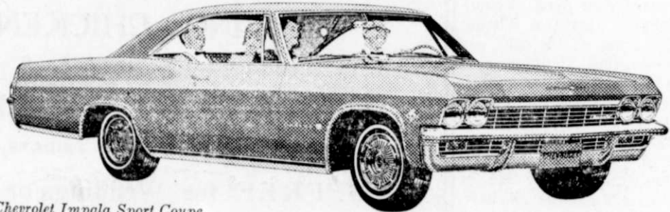
'65 Chevrolet Impala Sport Coupe

So place your order now for delivery on the beautiful new kind of '65 Chevrolet that's right for you!