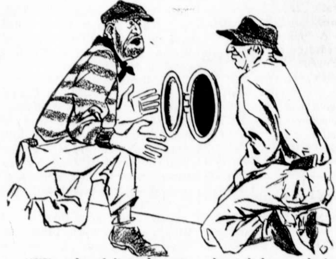
"We should've known they'd keep their valuables at the"