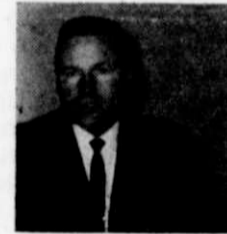
SEE OR CALL