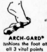
ARCH-GARD cushions the foot at all 3 vital points