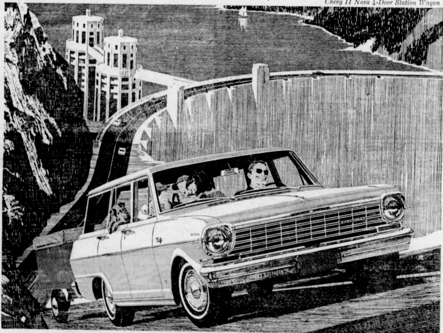
Chevy II Nova 1-Door Station Wagon

CHECK THE T-N-T DEALS ON CHEVROLET · CHEVELLE · CHEVY II · CORVAIR AND CORVETTE NOW AT YOUR CHEVROLET DEALER'S