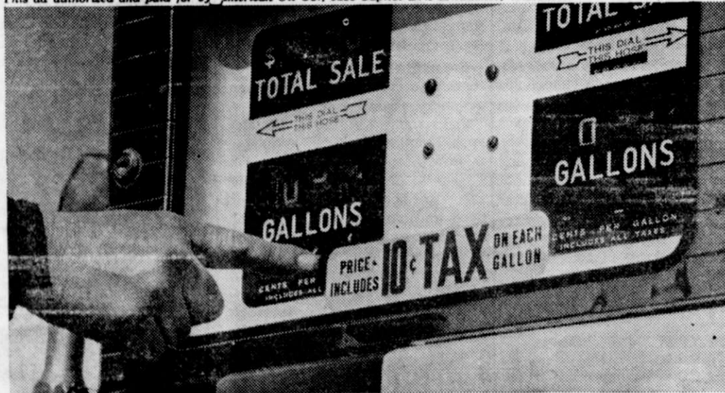
This ad authorized and paid for by American Oil Co., 9235 Capitol Dr., Milwaukee, Wisconsin.