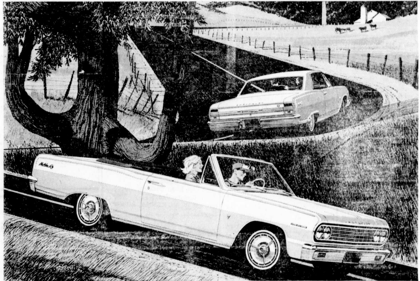
Background, new Chevelle Malibu Super Sport Coupe; foreground, Chevelle Malibu Super Sport Convertible.