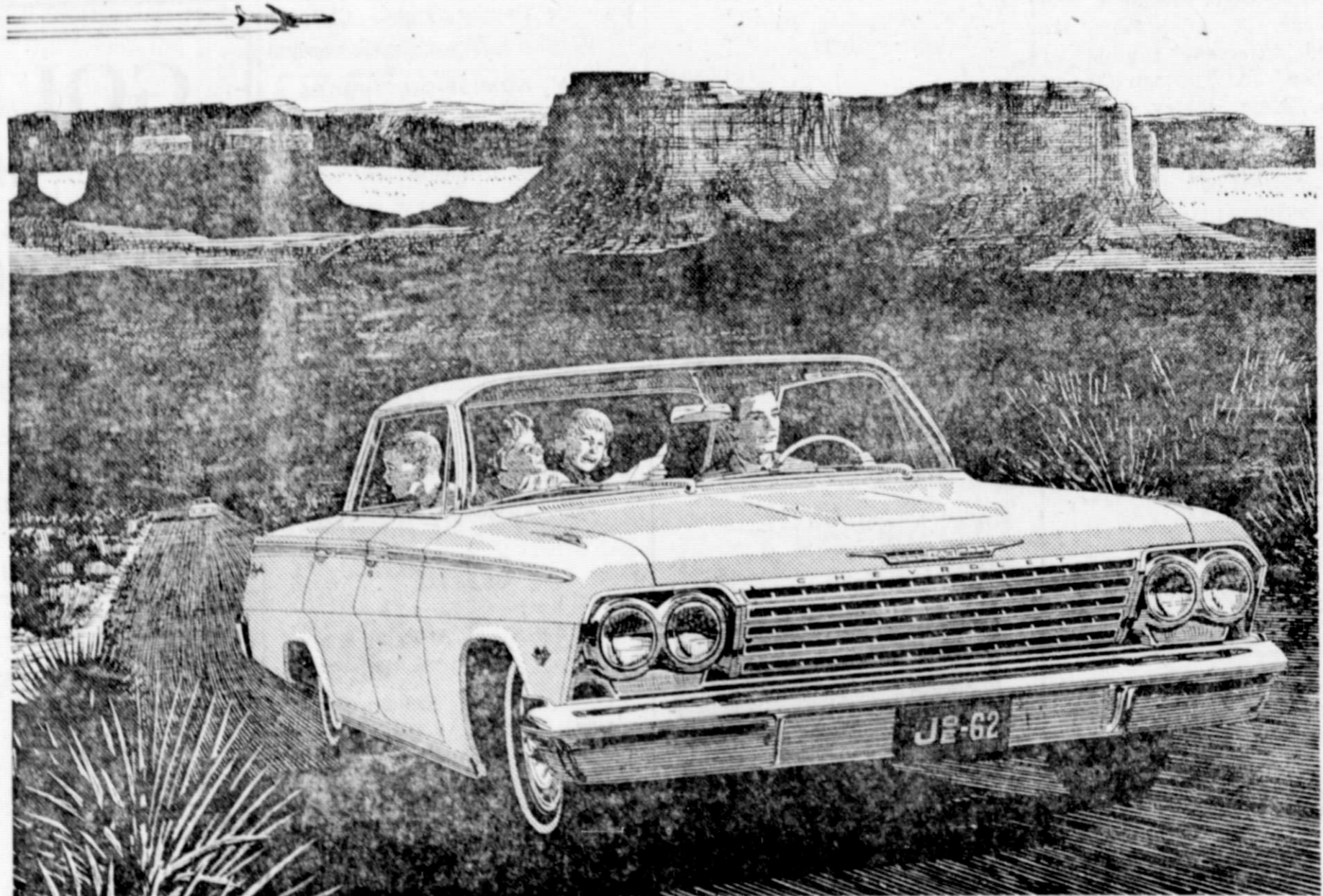
Impala 4-Door Sport Sedan—just one of 14 restful, zestful Jet-smooth beauties.

See the new Chevrolet at your local authorized Chevrolet dealer's