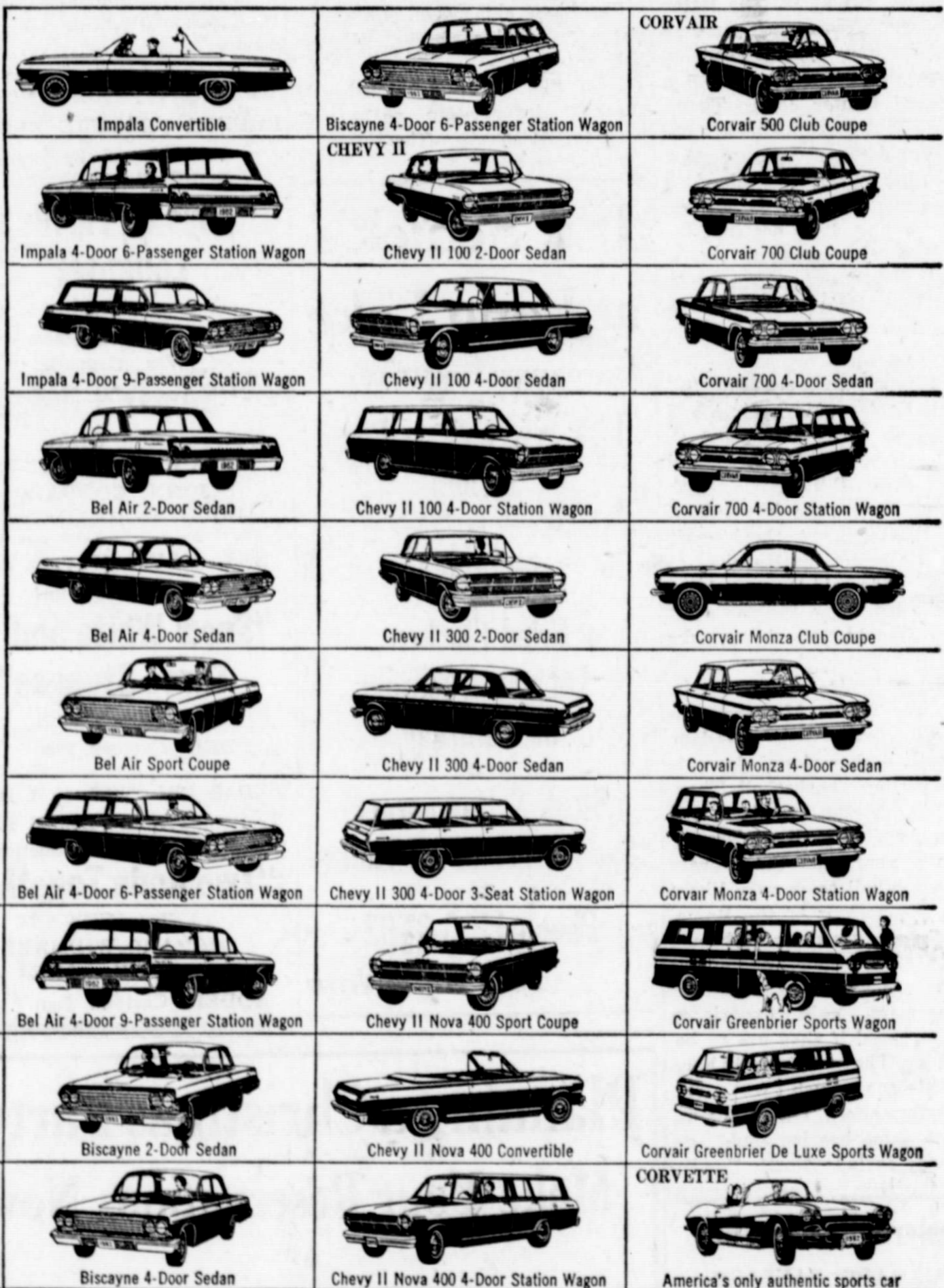
Impala Convertible, Impala 4-Door 6-Passenger Station Wagon, Impala 4-Door 9-Passenger Station Wagon, Bel Air 2-Door Sedan, Bel Air 4-Door Sedan, Bel Air Sport Coupe, Bel Air 4-Door 6-Passenger Station Wagon, Bel Air 4-Door 9-Passenger Station Wagon, Impala 4-Door Sedan, Impala 4-Door Sport Sedan, Impala Sport Coupe, Biscayne 4-Door 6-Passenger Station Wagon, Biscayne 2-Door Sedan, Biscayne 4-Door Sedan, Chevy II 100 2-Door Sedan, Chevy II 100 4-Door Sedan, Chevy II 100 4-Door Station Wagon, Chevy II 300 2-Door Sedan, Chevy II 300 4-Door Sedan, Chevy II 300 4-Door Station Wagon, Chevy II 300 4-Door 3-Seat Station Wagon, Chevy II Nova 400 Sport Coupe, Chevy II Nova 400 Convertible, Chevy II Nova 400 4-Door Station Wagon, Corvair 500 Club Coupe, Corvair 700 Club Coupe, Corvair 700 4-Door Sedan, Corvair 700 4-Door Station Wagon, Corvair Monza Club Coupe, Corvair Monza 4-Door Sedan, Corvair Monza 4-Door Station Wagon, Corvair Greenbrier Sports Wagon, Corvair Greenbrier De Luxe Sports Wagon, CORVETTE, America's only authentic sports car

See the new Chevrolet, Chevy II, Corvair at your local authorized Chevrolet dealer's