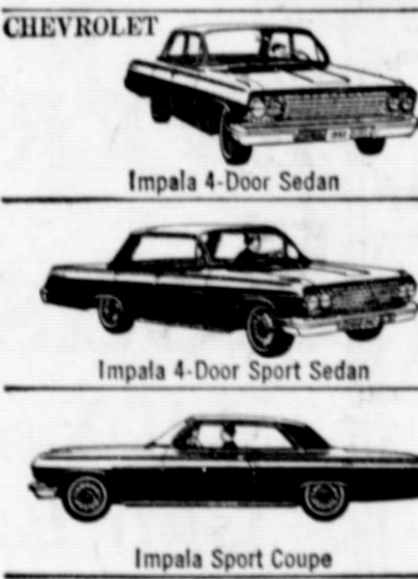
Impala 4-Door Sedan, Impala 4-Door Sport Sedan, Impala Sport Coupe, Bel Air 4-Door 9-Passenger Station Wagon, Biscayne 2-Door Sedan, Biscayne 4-Door Sedan, Chevy II Nova 400 Sport Coupe, Chevy II Nova 400 Convertible, Chevy II Nova 400 4-Door Station Wagon