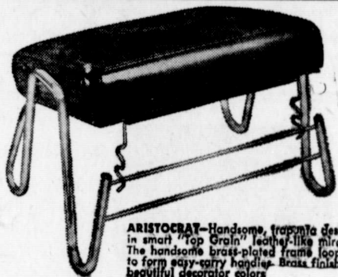
ARISTOCRAT—Handsome, trapunto designed 5" cushion in smart "Top Grain" leather-like miracle vinyl fabric. The handsome brass-plated frame loops above cushions to form easy-carry handles. Brakes finished last. In these beautiful decorator colors

Leg-Loungers are a patented Pearl-Wick product. Pat. No. 2,838,097. Pat. No. 2,838,098