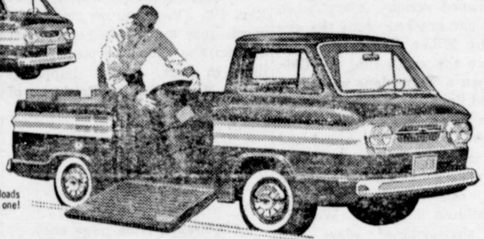
RAMPSIDE—Roll out the heavy loads—nothing to it in this one!