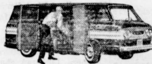
CORVAN—Side doors open a full 49" wide. Loading height is a low 14" lift!

Big Manitou Falls in Pattison state park is the highest waterfall in Wisconsin. It is 165 feet high.