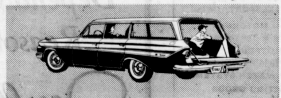
New Nomad 9-Passenger Station Wagon—Most luxurious of Chevy's six best selling wagons.

See the new Chevrolets at your local authorized Chevrolet dealer's