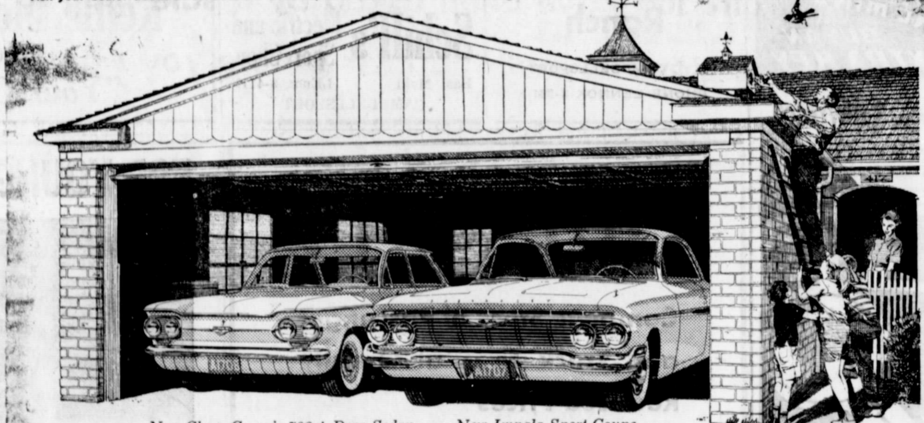
New Chevy Corvair 700 4-Door Sedan New Impala Sport Coupe

Ask your dealer about a real cool extra-cost option—Chevrolet air conditioning.