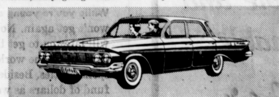
New Bel Air 4-Door Sedan—Popularly priced and packed with all the Chevy virtues.