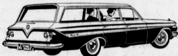
Nomad 9-Passenger Station Wagon. Chevrolet's the full-sized wagon more people are picking. A choice of six to save on from nifty Nomads to thrifty Brookwoods.