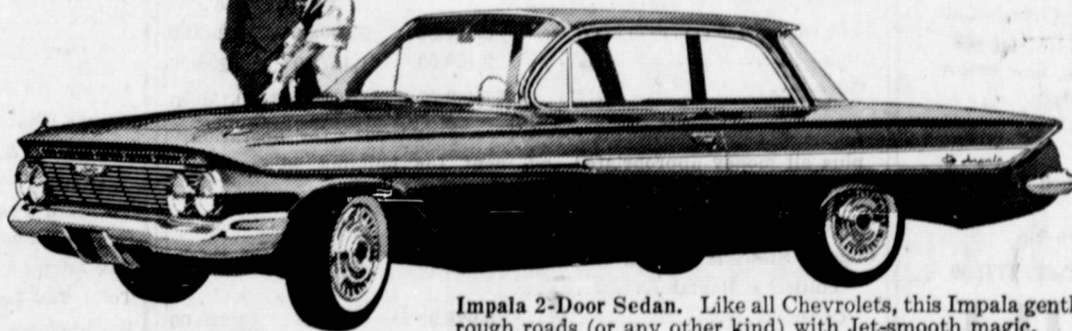
Impala 2-Door Sedan. Like all Chevrolets, this Impala gentles rough roads (or any other kind) with Jet-smooth magic.