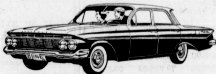
Bel Air 4-Door Sedan. Priced just above the thriftiest full-sized Chevrolets, Bel Airs give you the full treatment of Body by Fisher craftsmanship.