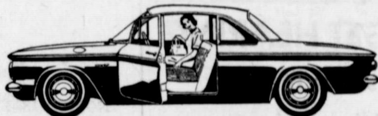
Corvair 700 Club Coupe. A 2-door budget-minded beauty with thistledown handling, rear-engine traction and quick-stepping, sassy performance.

Ask your dealer about a real cool extra-cost option—Chevrolet air conditioning.