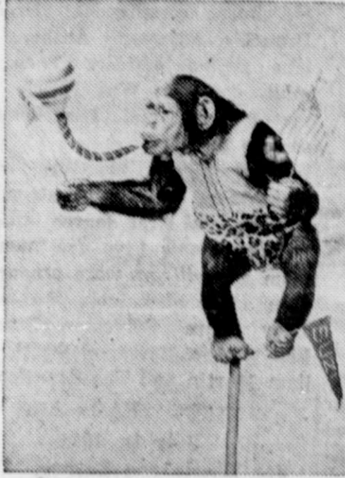
Suzie the Chimp