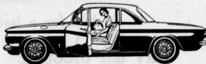
Chevy Corvair Monza Club Coupe

Save-a-bundle buys on Corvairs, too! The climate couldn't be better for getting into one of these. Yessirree, juicy July buys on the Monzas with their family-style sports-car spirit . . . on the nimble, nickel-nursing Corvair 500's and 700's . . . on the 6-Passenger Lakewood Wagons . . . and on those Greenbrier Sports Wagons with up to twice the space of regular wagons. Need more be said? Your Chevrolet dealer is the man to talk to.