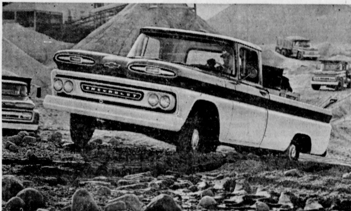
The famous Thriftmaster 6 does the saving as standard equipment in this Fleetside model. For V8 power, you can choose the Trademaster V8, optional at extra cost.