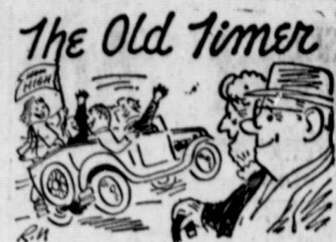
The Old Timer "The only thing wrong with the younger generation is that so many of us don't belong to it."

New members were installed at 6:30 p. m. Thursday at the college union prior to the chapter's 36th annual convocation banquet