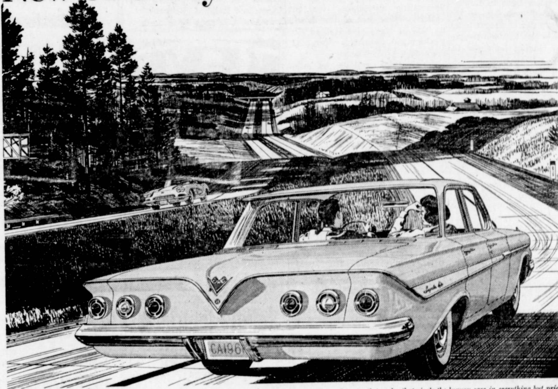
Impala 4-Door Sedan—Jet-smooth traveler that rivals the luxury cars in everything but price.

The '61 Chevy loves to go because it goes so well. Purrs along pavements like a happy tabby. Takes rough roads in stride and all roads in style.