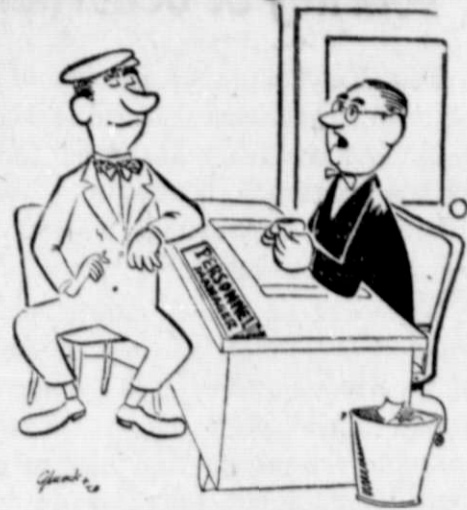
"Five months picketing—any other experience?"