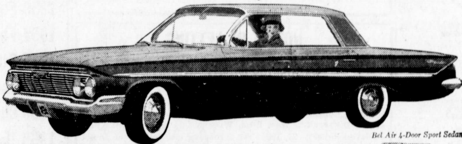
Bel Air 4-Door Sport Sedan