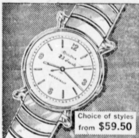
Choice of styles from $59.50