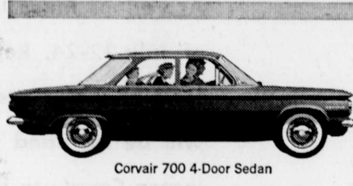
Corvair 700 4-Door Sedan

FOR ECONOMICAL TRANSPORTATION If you haven't driven it yet, you don't know what a delight driving can be. Its steering, response, traction and roadability are unique because it's a unique car — the only U.S. car with an air-cooled airplane-type rear engine, transaxle and independent suspension at all four wheels. Be in on the know. Find out what delightful differences this advanced design makes.