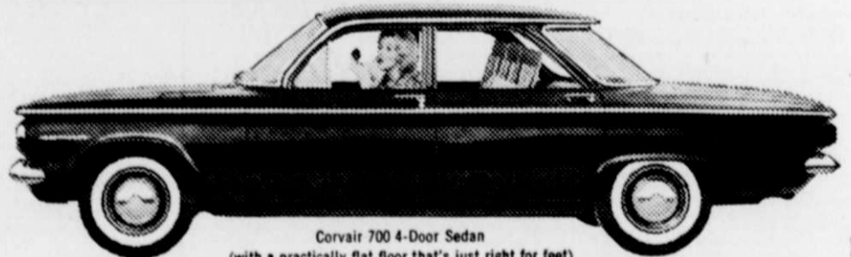
Corvair 700 4-Door Sedan (with a practically flat floor that's just right for feet)

See Chevrolet Cars, Chevy's Corvair and Corvette at Your Local Authorized Chevrolet Dealer's