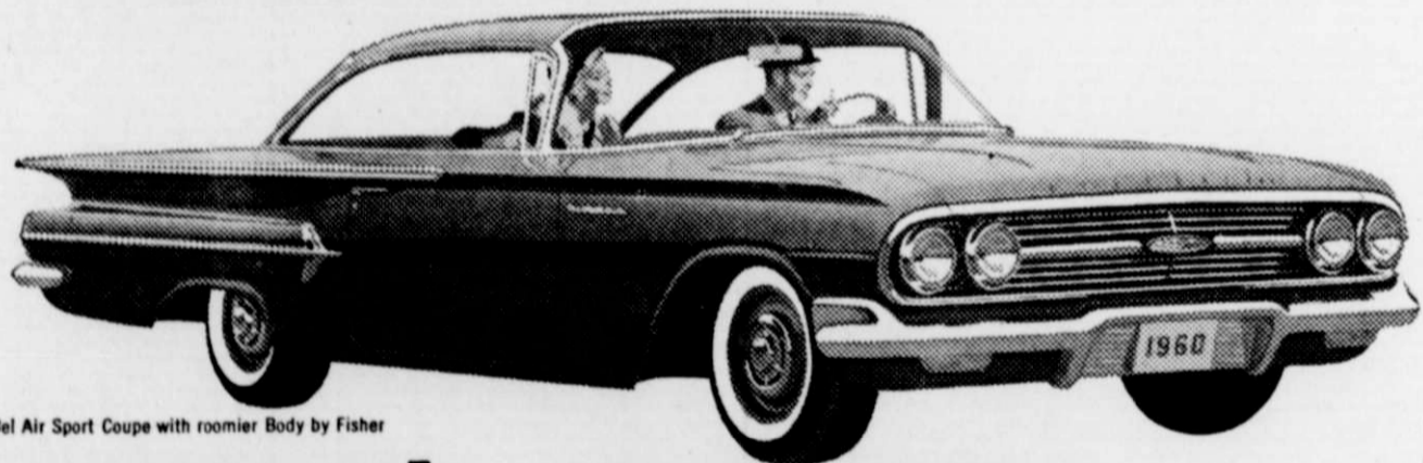
Bel Air Sport Coupe with roomier Body by Fisher

This year, more people are buying Chevrolets (including Corvairs) than ever before, making Chevy the year's hottest seller by a record-shattering margin. Come in and see what the buying's all about—at your Chevrolet dealer's soon!