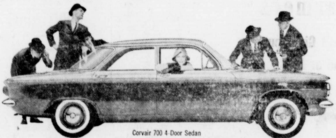
Corvaire 700 4-Door Sedan

Drive it—it's fun-tastic! See your local authorized Chevrolet dealer for fast delivery, favorable deals.