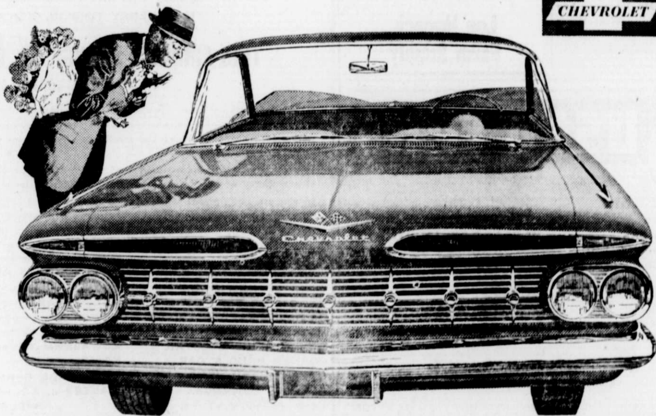
Impala Sport Coupe—with a Magic-Mirror luster that lasts and lasts.

now—see the wider selection of models at your local authorized Chevrolet dealer's!