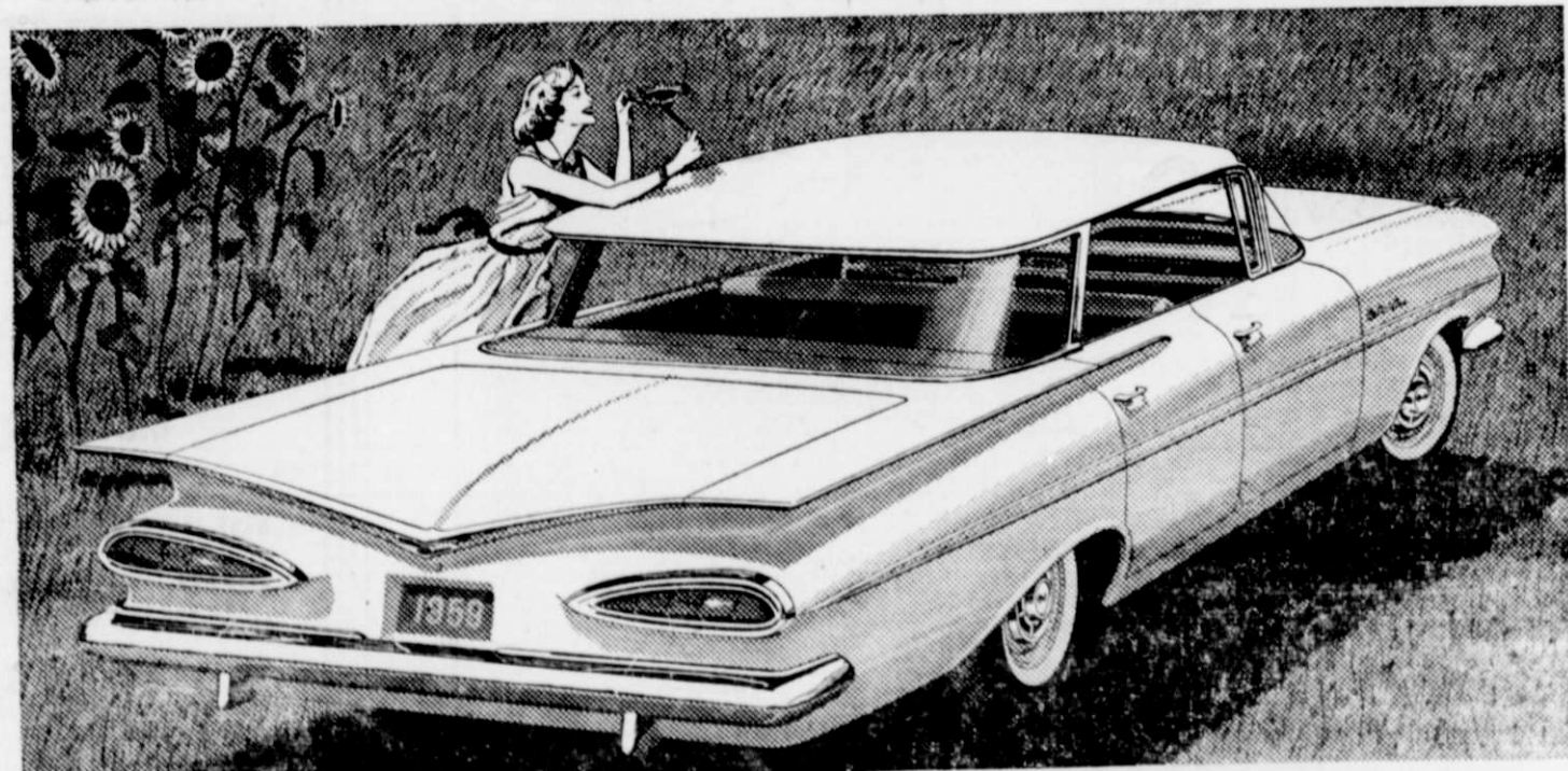
A new addition to Chevy's line—the beautiful Bel Air 4-Door Sport Sedan.

now—see the wider selection of models at your local authorized Chevrolet dealer's!