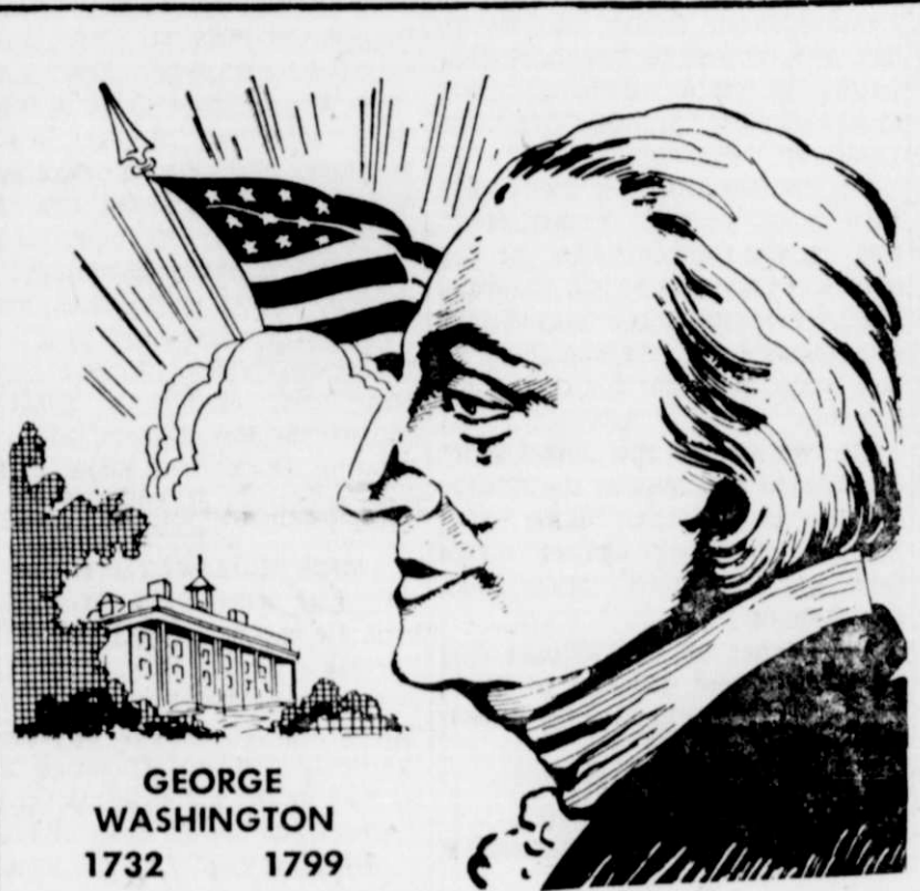
GEORGE WASHINGTON 1732 1799

He Knew No Glory But His Country's Good!