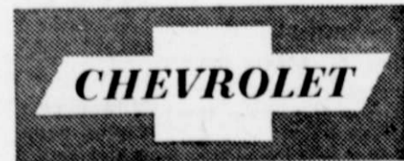
The smart switch is to the '59 Chevy!

the super-softness of Full Coil springing, in Easy-Ratio steering—then you'll know that this is the happiest surprise of the year. Come on in; don't miss this Open House!