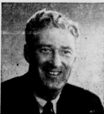
WARREN P. KNOWLES Republican Candidate Lieutenant Governor

Stay with a winner for Wisconsin... a man whose ability you know.