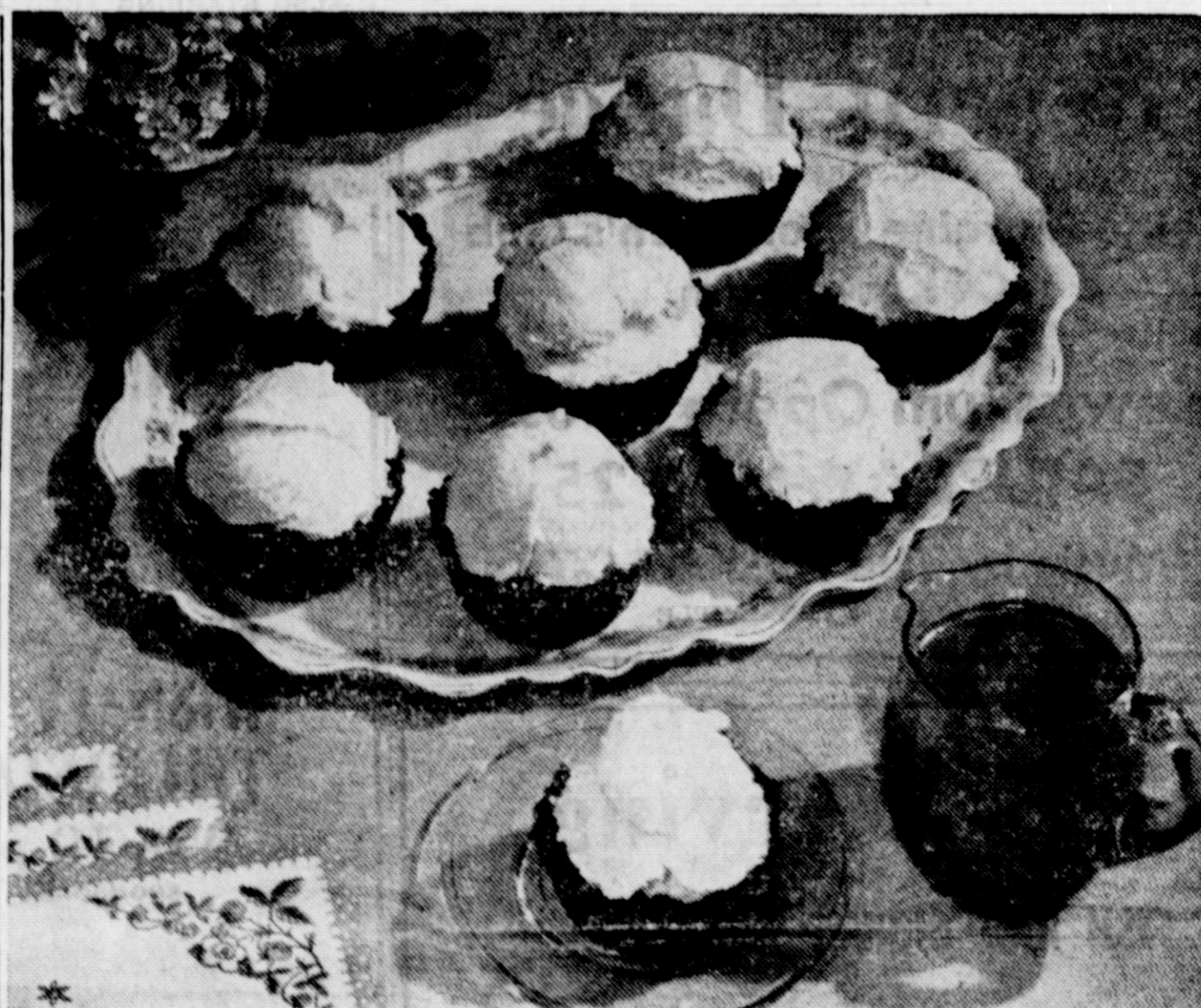
CHOCOLATE CEREAL BASKETS 8 baskets

Increasingly, ice cream is being served at various times of the day instead of just at the conclusion of a meal. For a between-meal snack, ice cream is refreshing and satisfying in a soda, sundae, milk shake, or just served by itself. Mothers find that Junior eats cereal with more gusto when it's topped with a mound of ice cream. Thus, America's favorite increases in popularity every day!