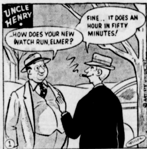
UNCLE HENRY sez: