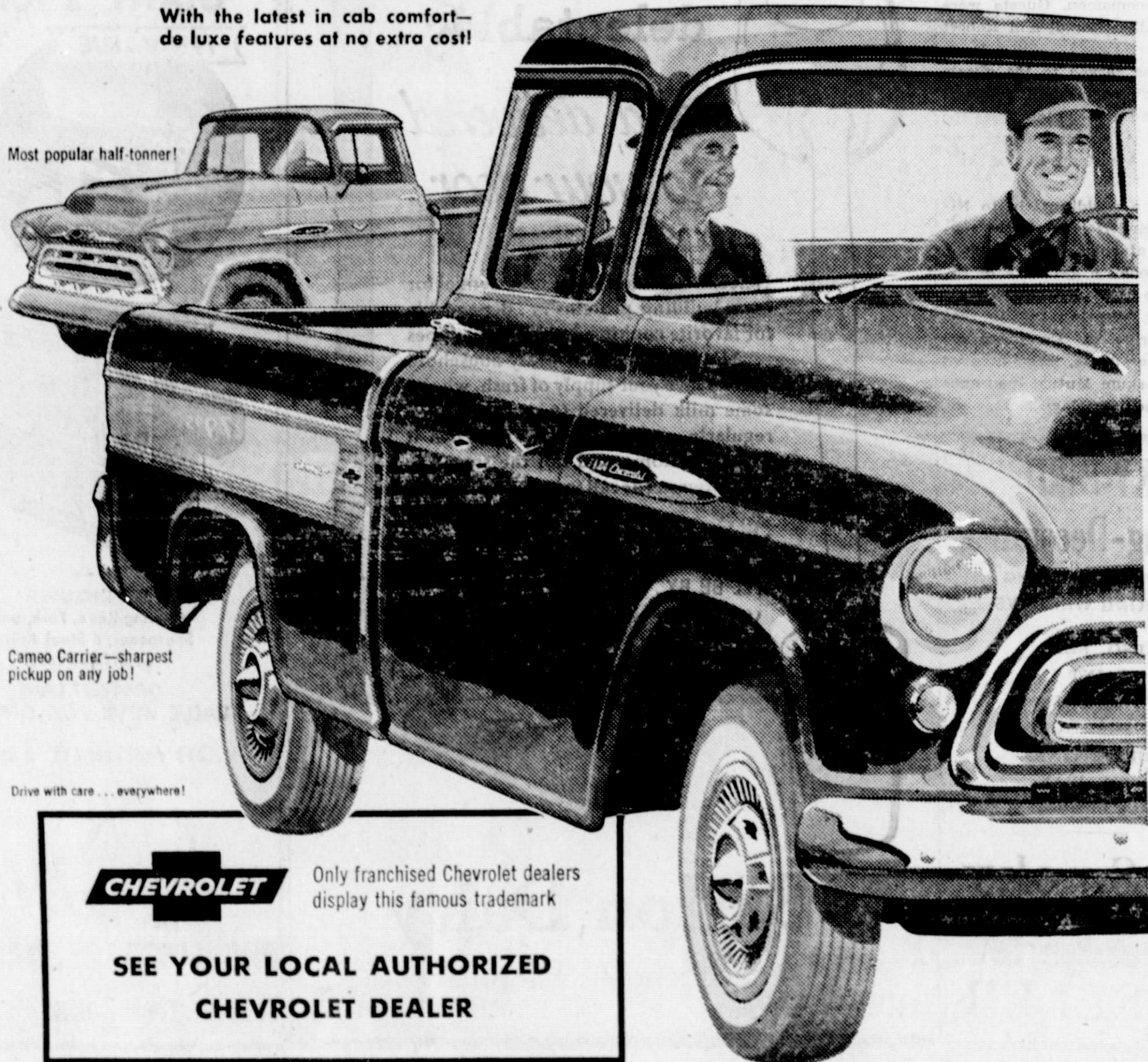
Most popular half-tonner!

With the latest in cab comfort—de luxe features at no extra cost!